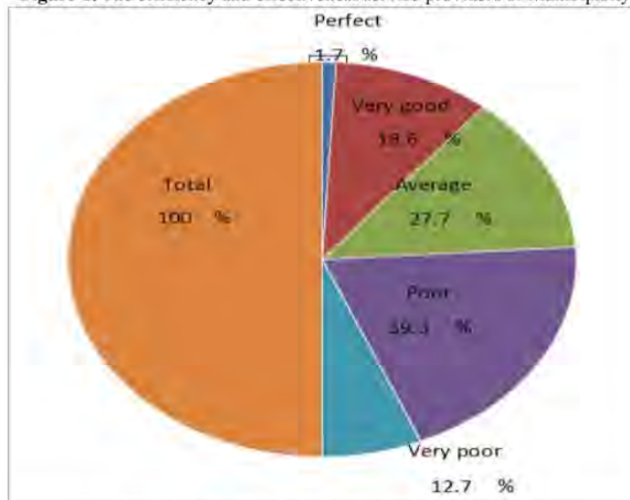
Figure 1. The efficiency and effectiveness service providers of Municipality